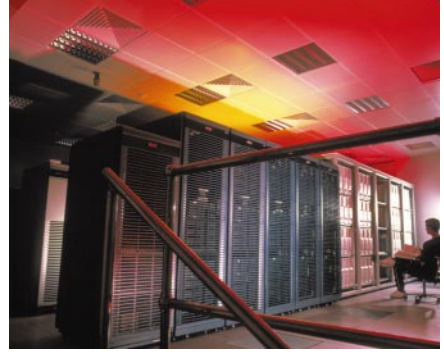
Computers will play an increasing role in biology.

has been critical to the production of the draft human genome published today. By locating a number of DNA sequences on the chromosomes, biologists provided themselves with a framework on which they could place sequence data. Without maps, accurately positioning DNA sequences would have been akin to assembling a 3-billion-