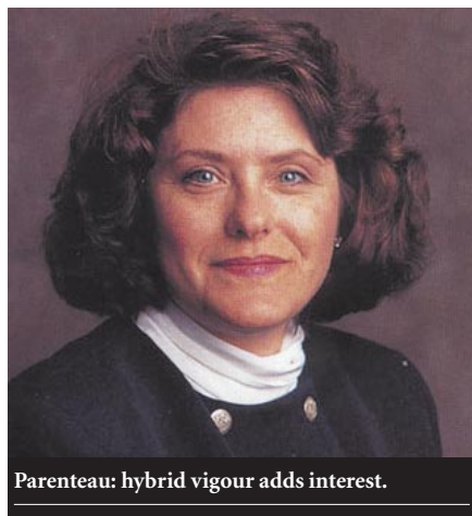
Parenteau: hybrid vigour adds interest.

With growing institutional support, the outlook for the next 10 to 15 years is rosy. Improvements in technique and understanding will speed up progress. For example, Naughton thinks that the question of embryonic stem cells will be obviated by improvements in separations and culturing.